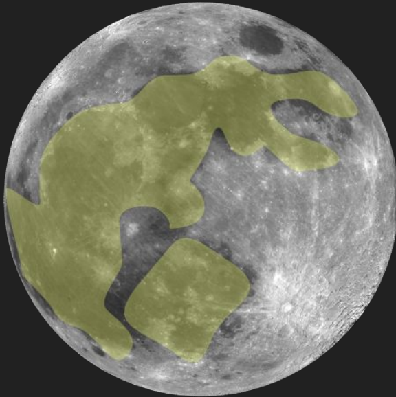
Rabbit standing near a pot